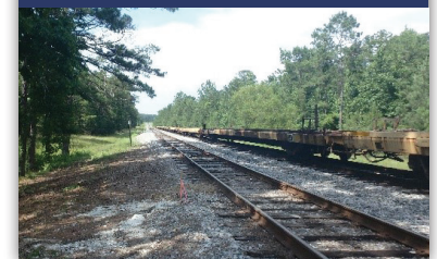
Fort Polk Railroad Rehabilitation, Vernon Parish, LA