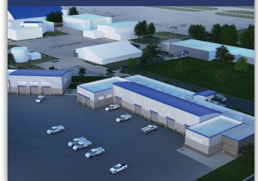
Civil Engineering Facilities, 183d Wing, Illinois Air National Guard, Springfield, IL