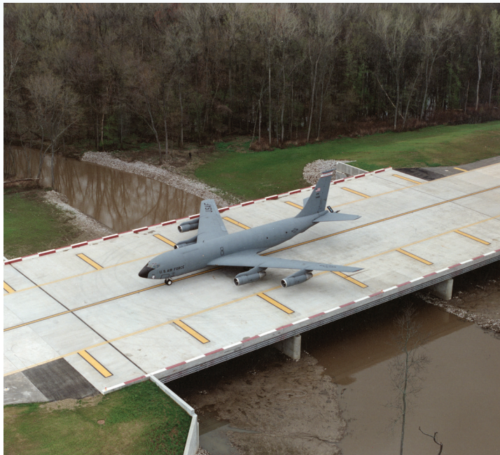
Scott Air Force Base Taxiway Bridge, St. Clair County, IL