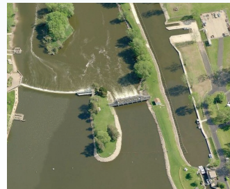
Stratton-Bolger Lock and Dam on Fox River, McHenry County, IL