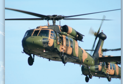
Weide Army Airfield Heliport Master Plan, Aberdeen Proving Ground, MD

35 YEARS' experience in completing federal projects